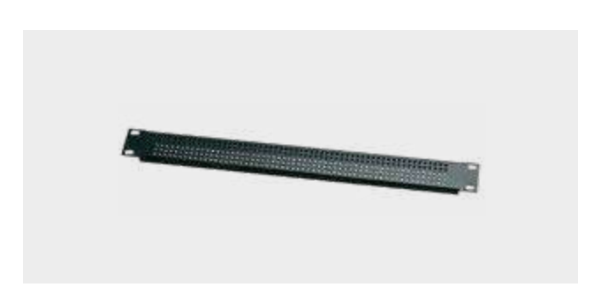
Air-cooling panel among devices. Size: 1 unit.