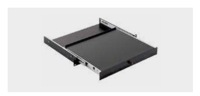
Sliding support shelf. Size: 1 unit.